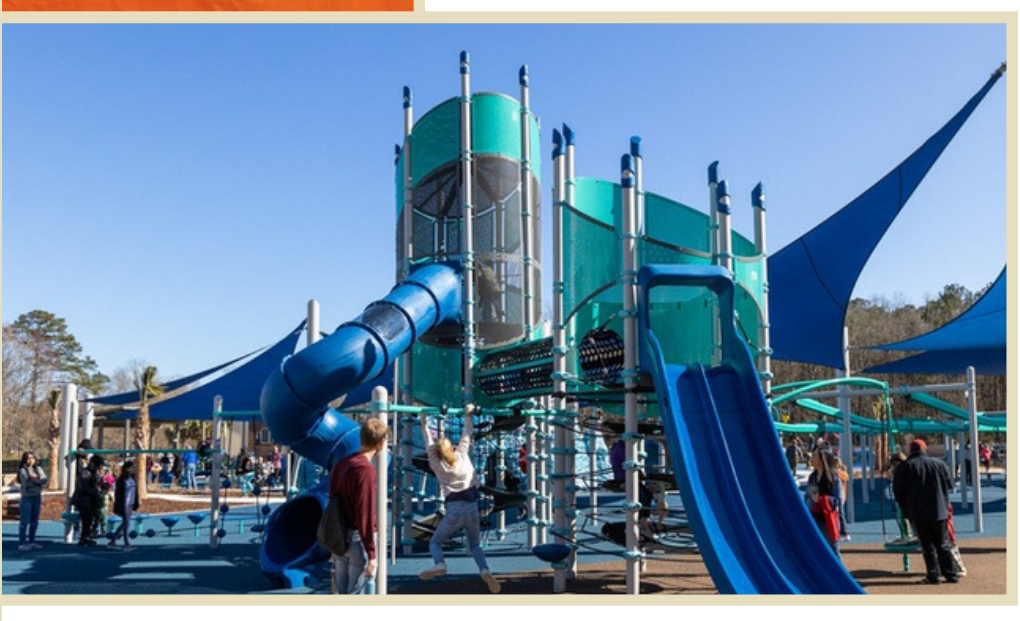
Check out SPARK in the Park 2024 on Live 5 News!