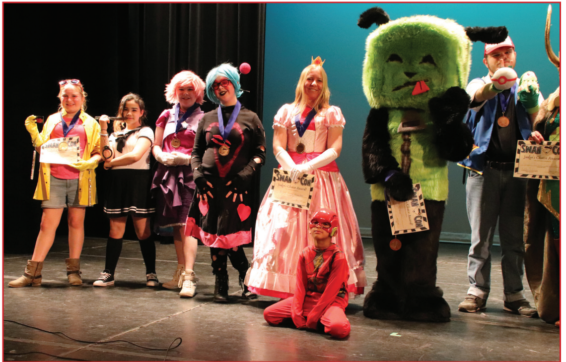
Swan Con began on March 22 in the USC Sumter Arts & Letters Building Lecture Hall and featured artist panels. The two-day comic arts festival continued on March 23 at Patriot Hall with vendors, an artist panel and a panel on publishing comics. The culmination of the festival was a Cosplay contest (above) that provided awards to visitors dressed as their favorite characters from comic books, movies and anime.

The goal of this annual event is to bring comic artists to Sumter, S.C., to exhibit their work and lecture on their craft. Guest speakers discuss their past and current projects, and question-and-answer sessions follow each presentation. There are also opportunities to purchase and have works signed.