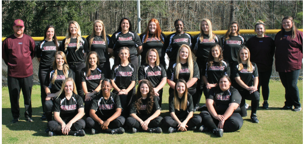
The USC Salkehatchie Softball Coach has won the NJCAA Division I Region X championship.